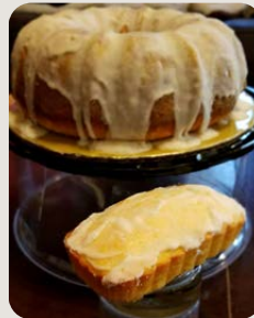
Grandma's Pound Cake

ALL THIS MOUTH--WATERING GOODNESS CAN BE YOURS!