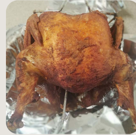
Cajun Fried Turkey

ALL THIS MOUTH--WATERING GOODNESS CAN BE YOURS!