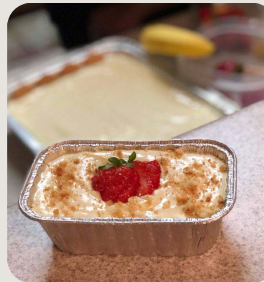
Strawberry Banana Pudding